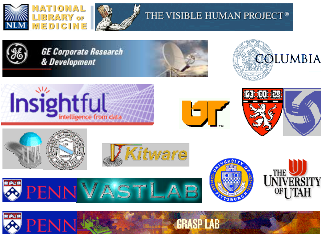
Figure 1. The Insight Software Consortium Members: The Office of High Performance Computing and Communications – NLM, General Electric Corporate R&D, Kitware, Inc., Insightful, Inc., the University of North Carolina at Chapel Hill, the University of Pennsylvania (the VAST Lab and the Department of Radiology), and the University of Tennessee, Harvard Brigham and Women’s Hospital, U. Penn’s GRASP Lab, the University of Pittsburgh, the University of Utah, and Columbia University.

The Insight Software Research Consortium including partners in academia and in industry has been formed to carry this work forward. The prime contractors are: General Electric Corporate R&D, Kitware, Inc., Insightful, Inc., the University of North Carolina at Chapel Hill, the University of Pennsylvania (the VAST Lab and the Department of Radiology), and the University of Tennessee. Subcontracts from the prime contractors have been extended to: Harvard Brigham and Women’s Hospital, U. Penn’s GRASP Lab, the University of Pittsburgh, the University of Utah, and Columbia University. The prime contractors and their subcontractors comprise the software research consortium with the principal investigators of the prime contractors serving as the governing board. Together with the NLM Office of High Performance Computing and Communications as the executive member, the Insight Software Consortium is working to deliver a software toolkit to improve and enable research in volume imaging for all areas of health care.